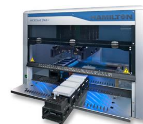
FIGURE 1: Hamilton Microlab STAR