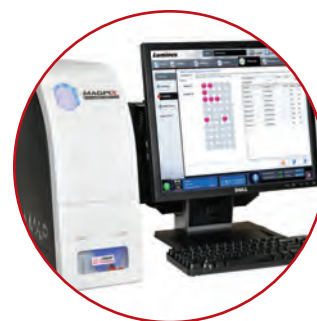
Up to 4,800 results in one hour